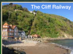
The Cliff Railway